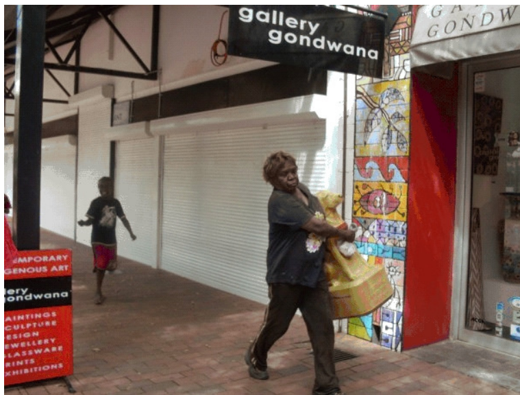
"Taking the dog for a walk.... Darwin Style"